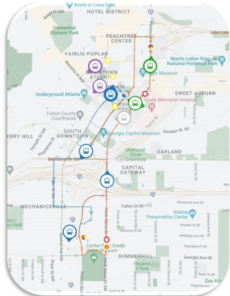
GSU Panther Express Last-Mile Service Route Map